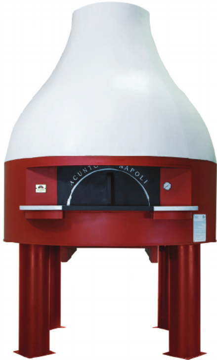
Standard Acunto Vesuvio 120 Model, shipped from Acunto factory, with removable legs